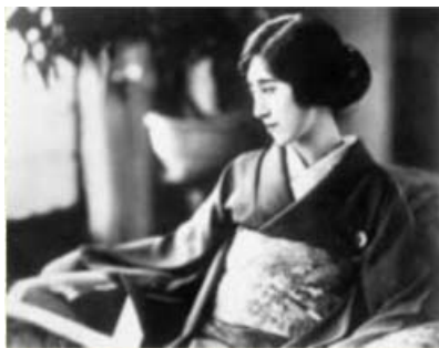
Lady Kujo Takeko

Commemorating the spirit of community service and giving as exemplified by